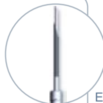
Extended Beveled Stylet